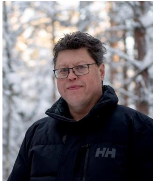
Reima Flyktman, nature document writer and nature photographer, Finland

I have been a member in many juries. I am especially keen on photographing nature, wild life and macro. Exhibition in 2020: "JUST ANIMALS" in FIAP's Exhibition Center Athens-Hellenic Photographic Society.